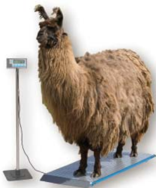
Shown with optional indicator stand