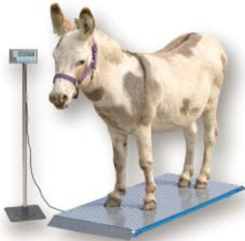
Shown with optional indicator stand

Easy Assembly – No installation costs or parts that require maintenance. Just place the scale on a hard surface and level by adjusting the foot pads. Connect the indicator and turn on the power.