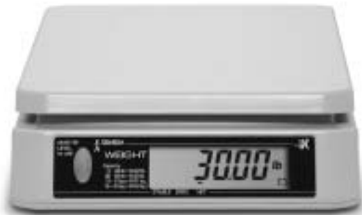
iPC with dual display